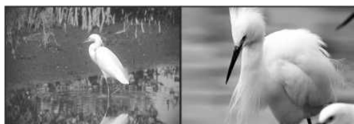
Snowy egret with feathers that are not fluffed

2 In cold weather, birds fluff up their feathers to keep themselves warm.