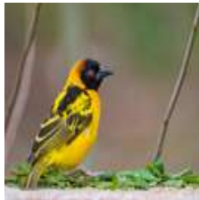
a) Weaver bird

The male bird makes beautifully woven nests. The female looks after all the nests and chooses the one that she likes the best and decides in which one to lay her eggs.